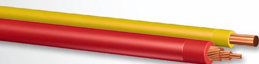
TFN/TFN Copper only