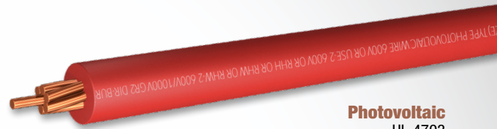
Photovoltaic UL 4703