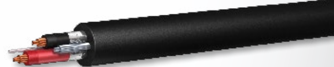
Tray Cable - Control or Instrumentation - Shielded - THHN/XHHW-2/RW90 Inners Available in 18 AWG-2 conductor through 10 AWG-12 conductor; Copper only