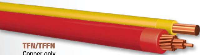
TFN/TFFN Copper only