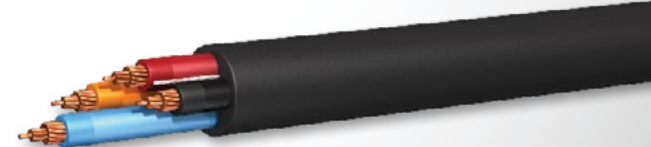
Tray Cable - Power and Control Cable - with or without Ground - THHN/XHHW-2/RW90 Inners Copper conductors available in 14 AWG-2 through 750 KCMIL-4, Aluminum conductors available in 6 AWG and larger