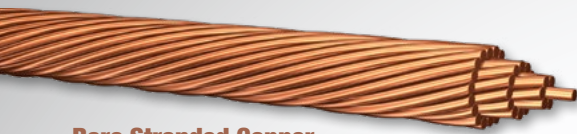
Bare Stranded Copper