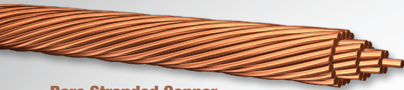
Bare Stranded Copper