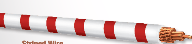
Striped Wire Available on any single conductor wire type