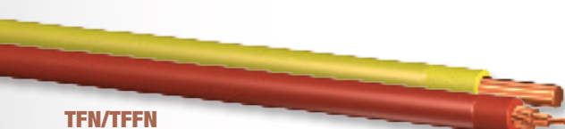
TFN/TFFN Copper only