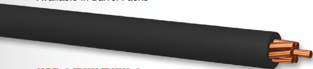
USE-2/RHH/RHW-2 Available in Barrel Packs