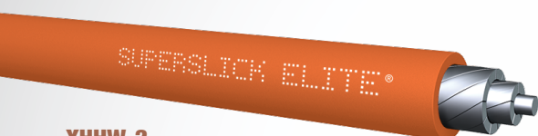
XHHW-2 Available in Barrel Packs