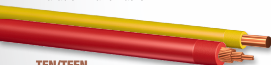
TFN/TFN Available in Barrel Packs; Copper only