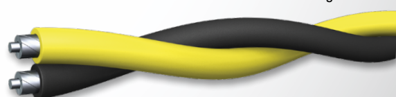
Underground/Secondary Distribution Cable (URD) - 600V Duplex, Triplex, and Quadplex constructions available in 1350 Alloy and 8000 Series; Aluminum only