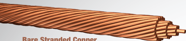
Bare Stranded Copper Available in Barrel Packs