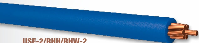
USE-2/RHH/RHW-2 Available in Barrel Packs