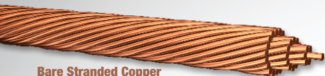
Bare Stranded Copper Available in Barrel Packs