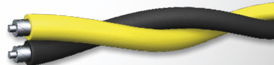
Underground/Secondary Distribution Cable (URD) - 600V Duplex, Triplex, and Quadplex constructions available in 1350 Alloy and 8000 Series; Aluminum only