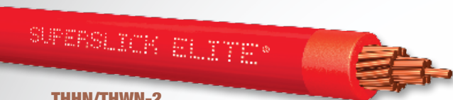
THHN/THWN-2 Available in Barrel Packs