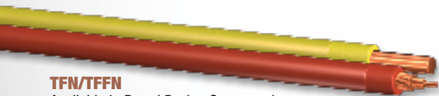
TFN/TFN Available in Barrel Packs; Copper only