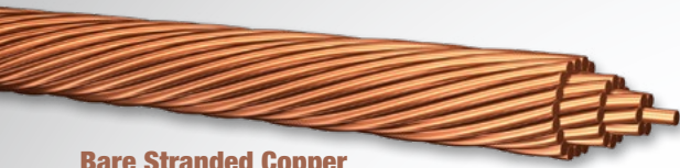
Bare Stranded Copper