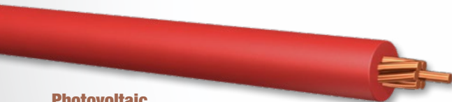
Photovoltaic UL 4703 Aluminum available in 8 AWG or larger